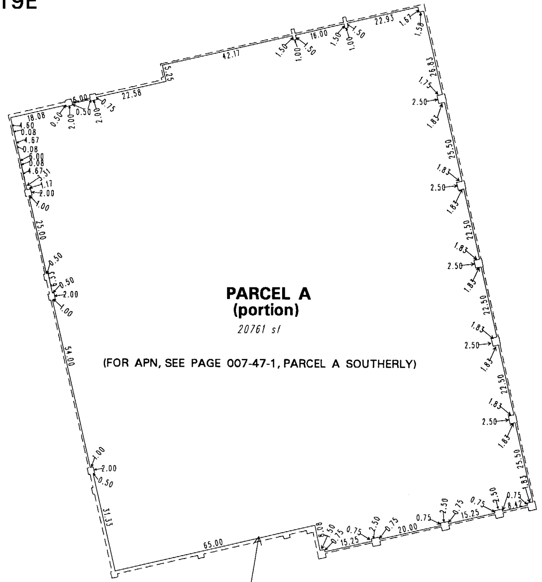
PARCEL A (portion) 20761 sf (FOR APN, SEE PAGE 007-47-1, PARCEL A SOUTHERLY)