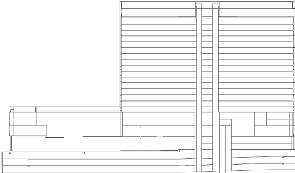
BUILDING ELEVATION (LOOKING WEST) - NOT TO SCALE -